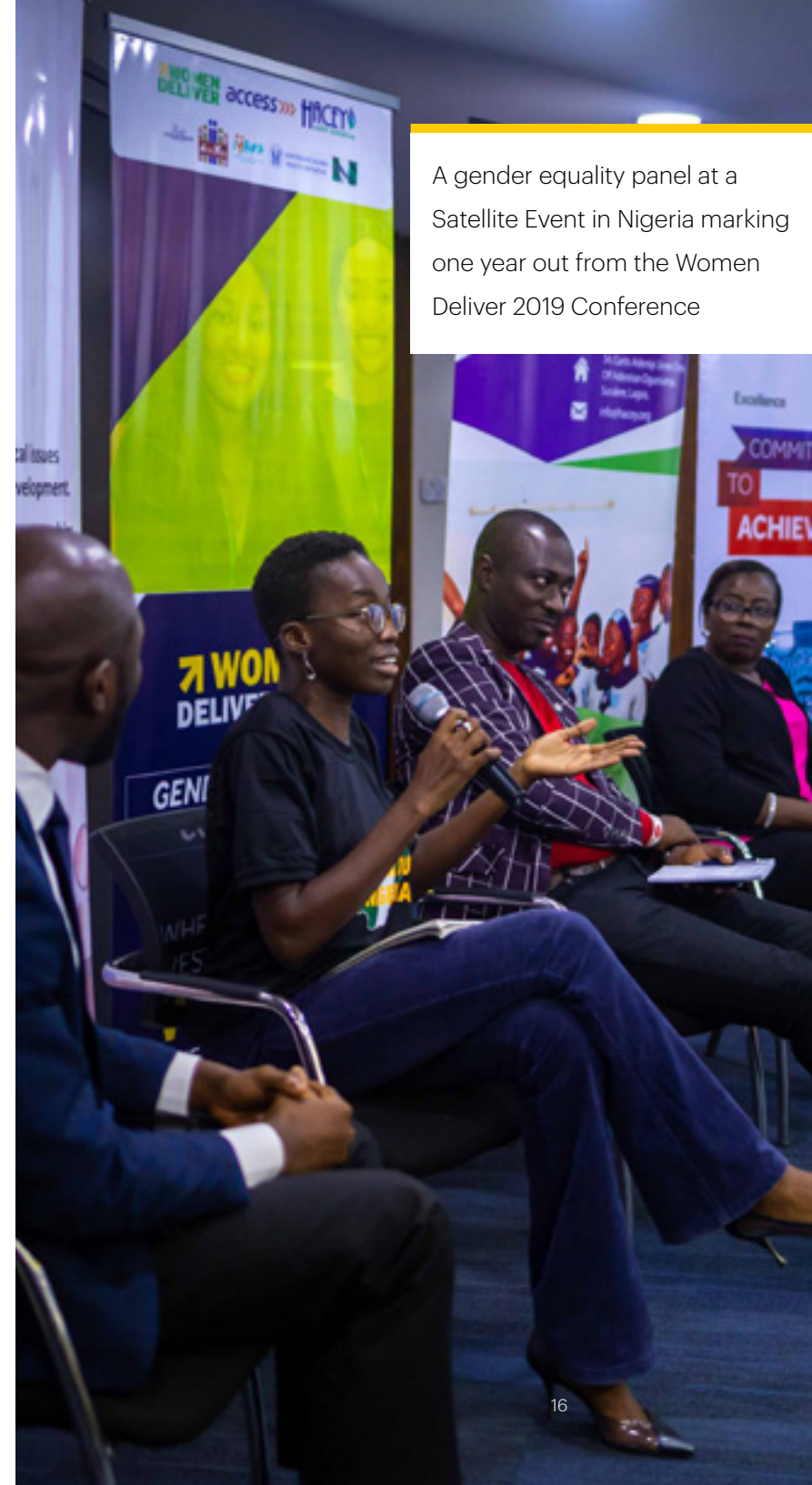
A gender equality panel at a Satellite Event in Nigeria marking one year out from the Women Deliver 2019 Conference

Finally, we'd love to learn what worked best for your unique event, so please feel free to share your own thoughts and ideas with our Satellite Event coordinator!