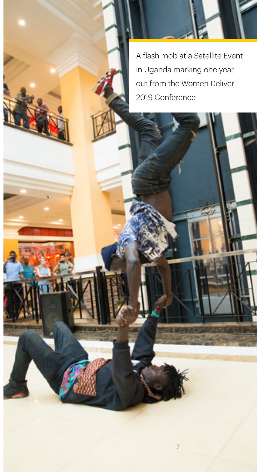
A flash mob at a Satellite Event in Uganda marking one year out from the Women Deliver 2019 Conference