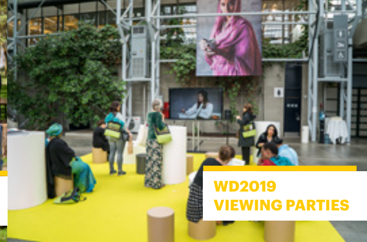
WD2019 VIEWING PARTIES