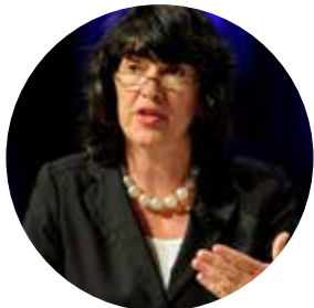
Christiane Amanpour , Journalist