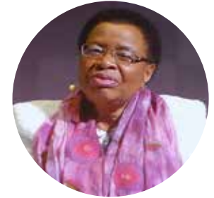
Graça Machel , Renowned Humanitarian and Global Advocate for women's and children's rights