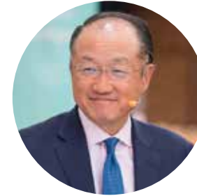
Jim Yong Kim , President, World Bank

The third Women Deliver Conference was one of firsts—hosted in Malaysia it was the first time the Prime Minister announced that family planning is a human right. It brought together 4,500+ attendees , 1/4 of whom were under the age of 30 and attending for the first time. 2,200 organizations were represented and 50,000+ viewers participated via webcasts.