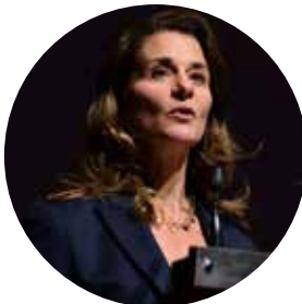
Melinda Gates , Co-founder, Bill & Melinda Gates Foundation

3,400 attendees from 146 countries focused on delivering solutions for girls and women. The conference was attended by 5 UN Agency Heads, the UN Secretary General, and 75 Ministers and Parliamentarians from 50+ countries .